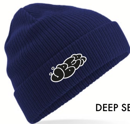
DEEP SEA BLUE