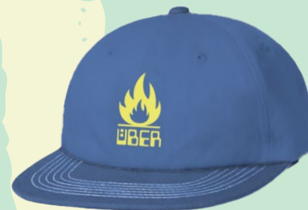
FIRE CAP - BLUE